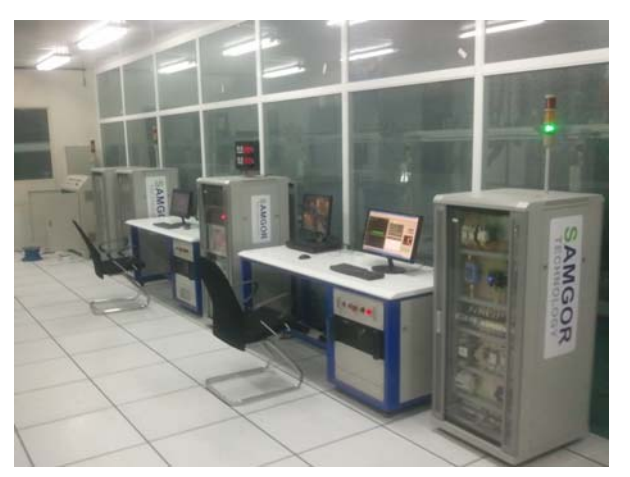
The Software have integrated all 5 test station control, all

The first feeling for the control room, the one of most important is the outlook of the control units, so Samgor supply the best metal type control desk with perfect surface treatment. After many years using, it also look like fresh and new. Control desk from Samgor also has the compact design, two separate computer be installed in one control desk.